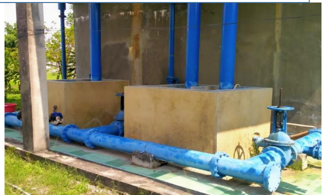
Korean Minh Hung Water Plant uses underground water that has just been received and exploited by Biwase