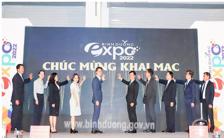
Representatives of the Ministry of Industry and Trade, leaders of Binh Duong province and industries pressed the button to open the fair

• BIWASE sponsors the program to connect supply and demand: For the first time, Binh Duong province organizes Binh Duong Expo 2022, gathering