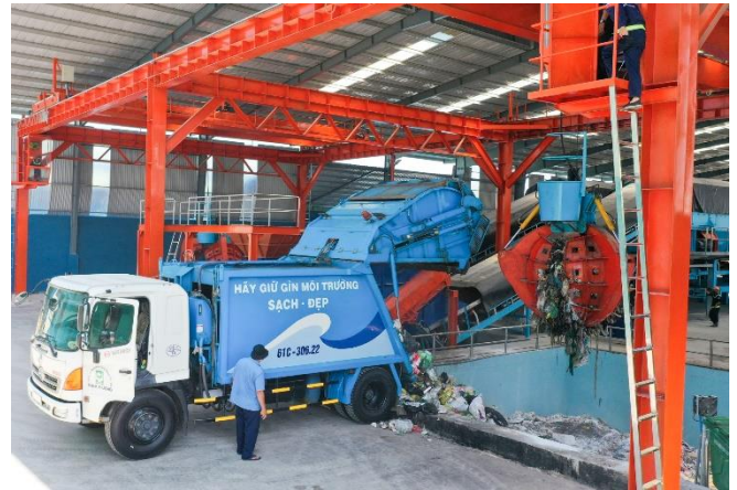
Receiving, classifying municipal waste

• In the fourth quarter of 2022, all affiliated branches increased their output: Along with the recovery momentum, the province's economic growth (from 8% to 13%) all branches under BIWASE in many fields increased their output, which in detail: waste treatment increased by 15% over the same period, an average of 2,750 tons/day. In which, domestic waste treatment increased 28%, revenue was 180 billion VND, up 17% compared to the year plan. The field of wastewater collection and treatment is on track to grow by 11%. Binh Duong Provincial People's Committee has approved the project to expand the existing wastewater treatment plant and develop a new factory with a new domestic wastewater collection and treatment system in