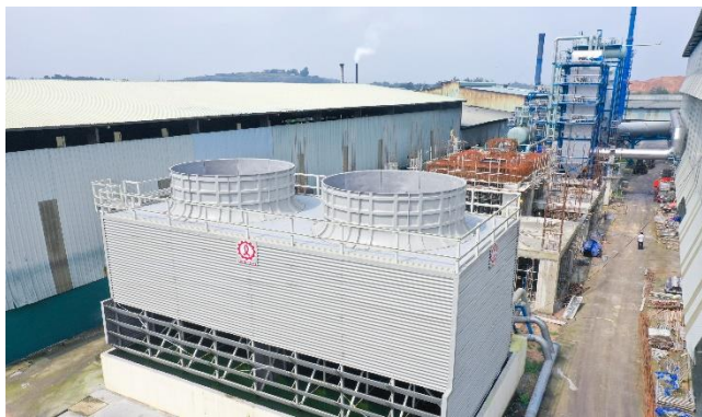
5MW generator complex using energy from garbage incinerators