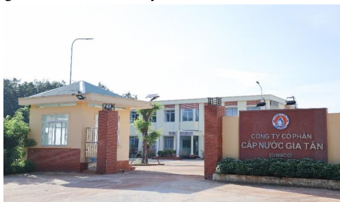
Gia Tan Water Plant increased 100% capacity and strongly developed the transmission network to many districts of Dong Nai province

• In 2023 Gia Tan water supply will increase 100% of capacity. With 50km of level 1 transmission pipeline, D600-1000mm, Gia Tan Water Supply Joint Stock Company (GIWACO) has successfully installed and brought clean water to people in Cam My, Long Thanh and Trang Bom districts, Long Khanh city, Dinh Quan, Dong Nai province..., the localities where have never had clean water to use. Due to the steep hilly terrain and the height difference from 50 to 100m, the investor must arrange and install more booster stations to ensure stable water source for customers. It is expected that by 2023 GIWACO's clean water output will increase by 100%.