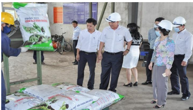
Binh Duong Elephant Fertilizer is popular with farmers, wherever it is produced, it is consumed

• Con Voi Binh Duong Fertilizer is popular with farmers, they are consumed right after being produced: